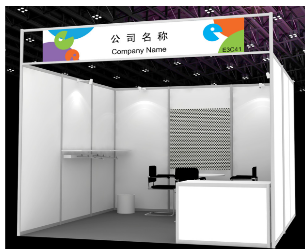
The Cost of a 3m x 3m Stand is £2790 - funding of £3,000 is available per exhibitor.